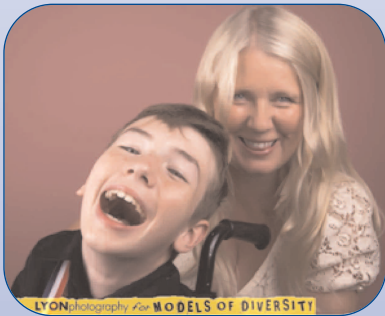
Mothers and Sons